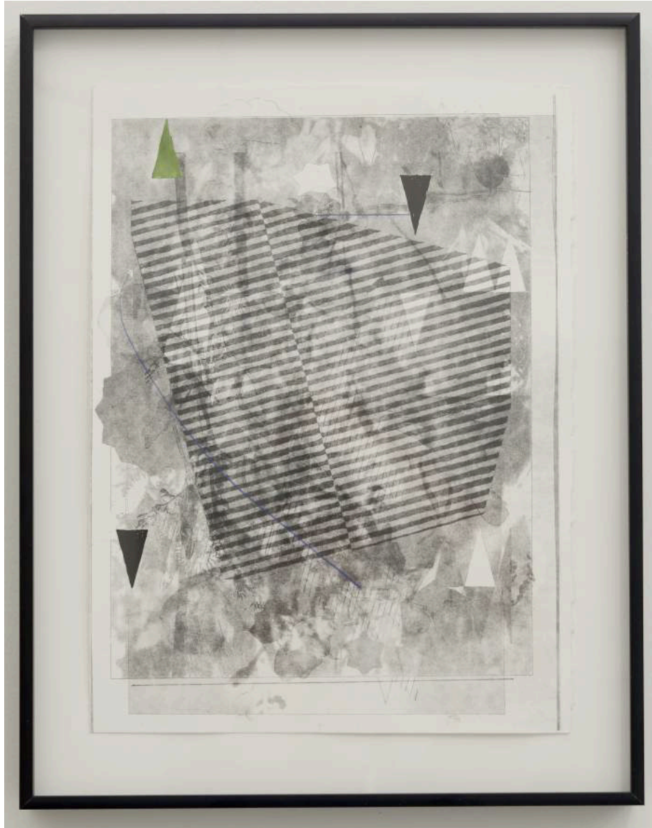
Untitled (Wander and Errancies - memories within) ii, 2020 Transfer and drawing on paper 15 x 11 inches