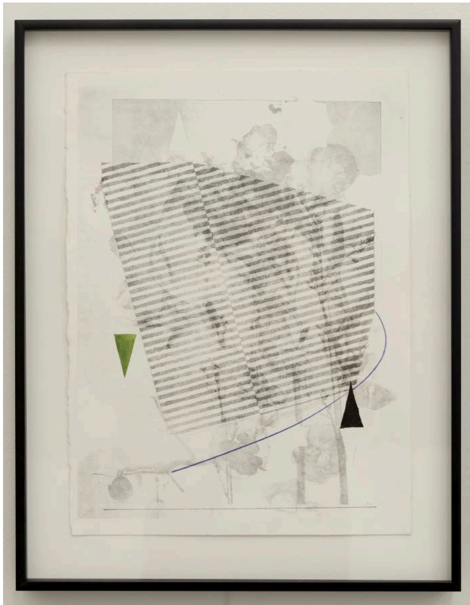
Untitled (Wander and Errancies - memories within) i, 2020 Transfer and drawing on paper 15 x 11 inches