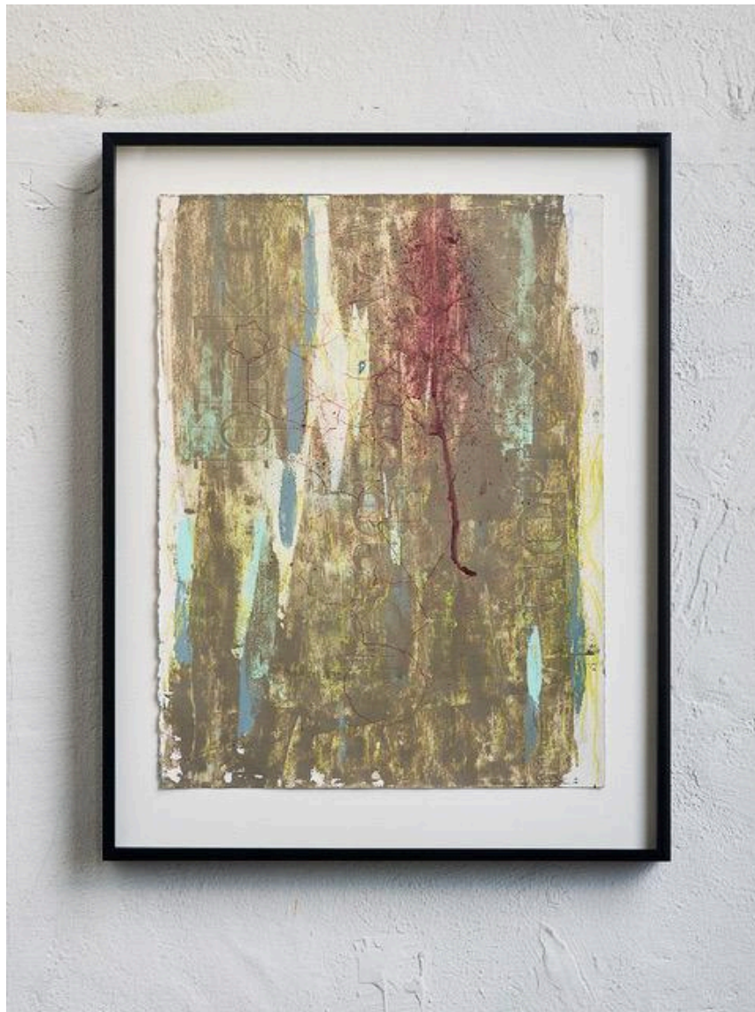
Untitled (Confluent inchoate figures marshal some fixity) i, 2024

Acrylic, colored pencil, gouache, gesso, graphite, ink, and vinyl decal on paper