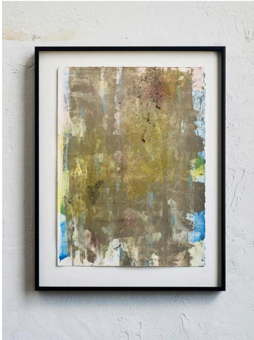
Untitled (Confluent inchoate figures marshal some fixity) iv, 2024

Acrylic, colored pencil, gouache, gesso, graphite, ink, and vinyl decal on paper