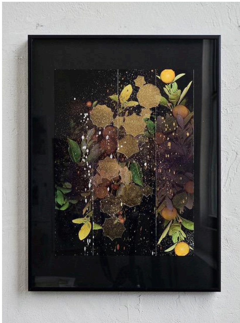
Untitled (Moving errantly toward liberatory forms, freedom scripted in an underground syntax) i, 2022

Colored pencil, enamel paint on cut and collaged paper 19 x 15 inches