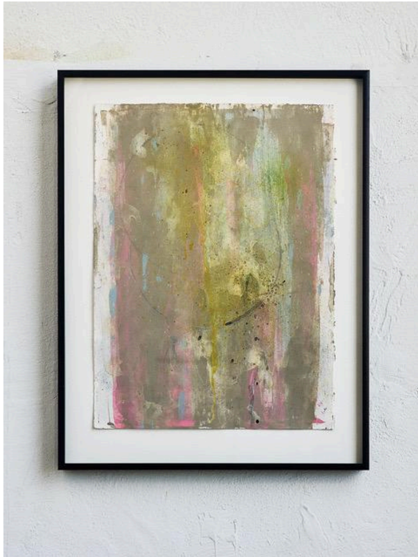
Untitled (Confluent inchoate figures marshal some fixity) ii, 2024

Acrylic, colored pencil, gouache, gesso, graphite, ink, and vinyl decal on paper