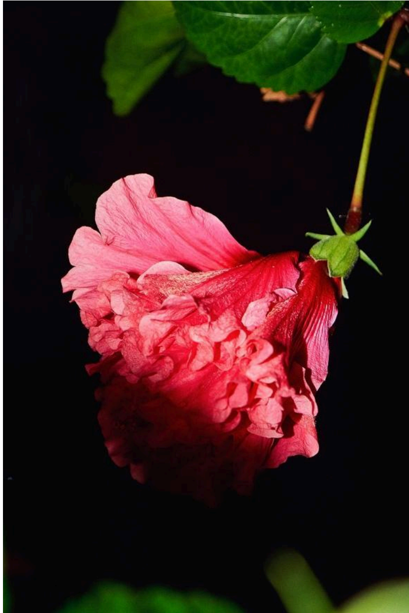
Untitled (This is the place where, with a resonant clarity, we fathom for fortitude) i , 2024 Archival pigment print on Hahnemühle photo rag 21 x 14 inches