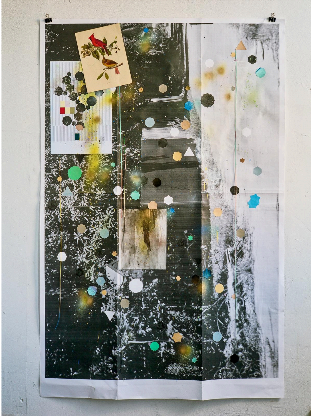
Untitled (...whispered intelligence lurking in the leaves; Cardinal), 2020-2024