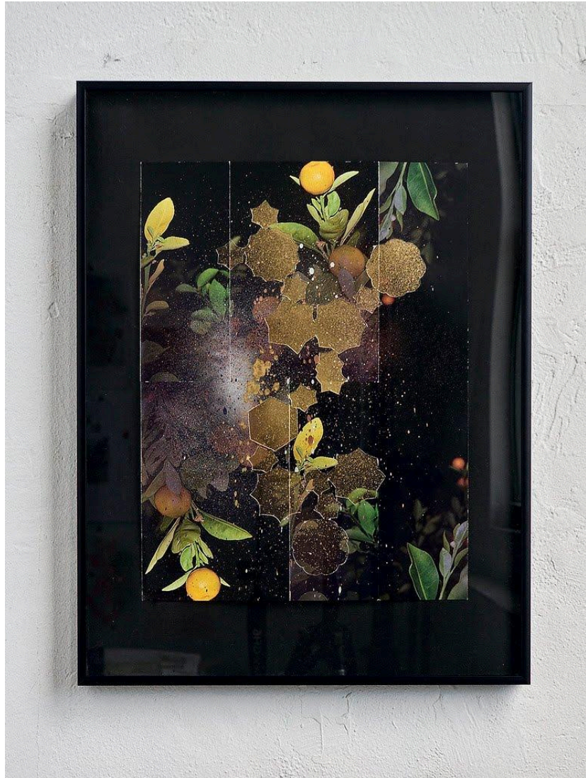
Untitled (Moving errantly toward liberatory forms, freedom scripted in an underground syntax) ii, 2022

Colored pencil, enamel paint on cut and collaged paper 19 x 15 inches