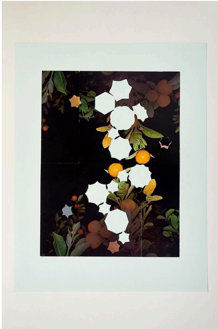
Untitled (Navigating errantly among liberatory forms and wander freely through Floridian groves; a gestural ode to JH) v, 2022