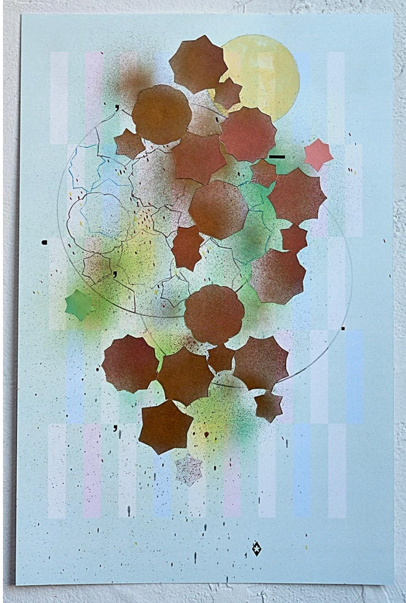
Untitled (Field Guide—exposure to enchanted forms) vi, 2022

Xerox transfer, graphite, silkscreen, monoprint and collage on paper