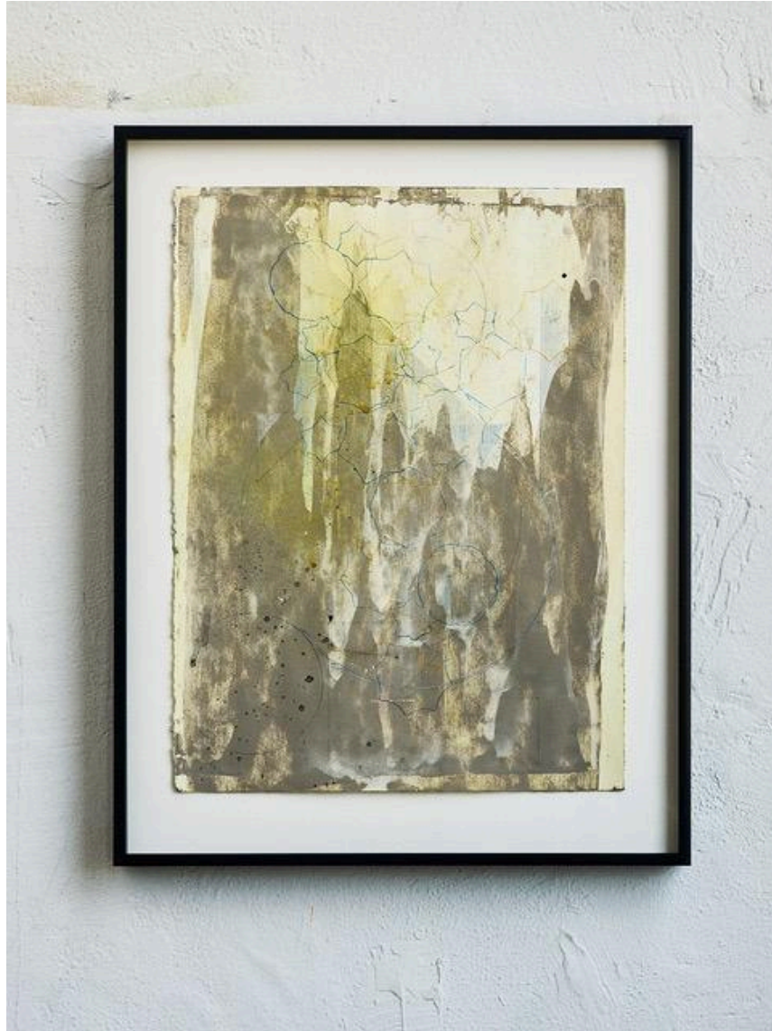
Untitled (Confluent inchoate figures marshal some fixity) iii, 2024

Acrylic, colored pencil, gouache, gesso, graphite, ink, and vinyl decal on paper