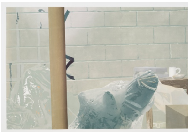
Membrane 2019 Woodblock print on Japanese Paper 20 x 30 inches 25 x 35 inches (framed) Edition of 10 $1300 $1800 (framed)