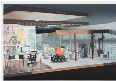
Event Horizon 2021 Woodblock print on Japanese Paper 20 x 30 inches 25 x 35 inches (framed) Edition of 10 $1300 $1800 (framed)