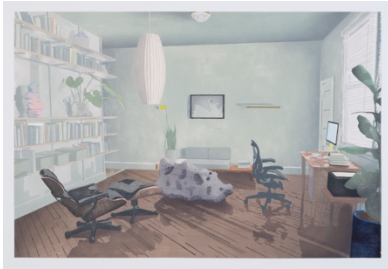
Meteorite 2020 Woodblock print on Japanese Paper 20 x 30 inches 25 x 35 inches (framed) Edition of 10 $1300 $1800 (framed)