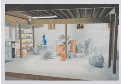
Poised Upon the Edge 2021 Woodblock print on Japanese Paper 20 x 30 inches 25 x 35 inches (framed) Edition of 10 $1300 $1800 (framed)